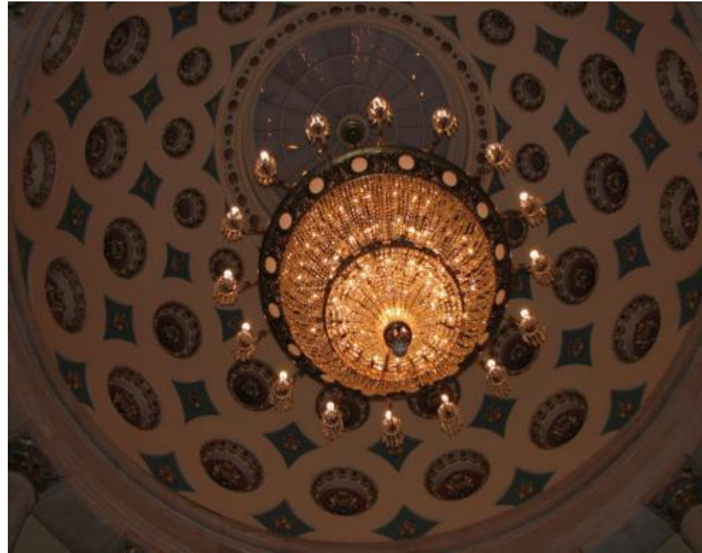
Capitol architecture on the Hill