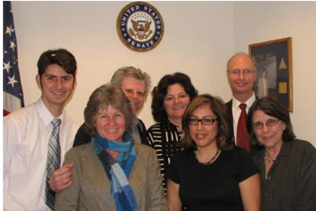
Citizens meet in local district U.S. Senate office